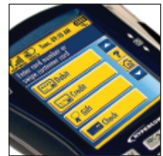
Brilliant LED backlit color screen