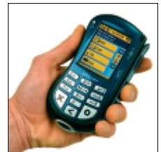
Ergonomic palm-size design

Count on Blade to help you open new markets, offer more services, increase efficiency and improve profitability. It's the sure, secure solution for businesses that reject boundaries.