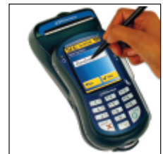
Signature capture capabilities